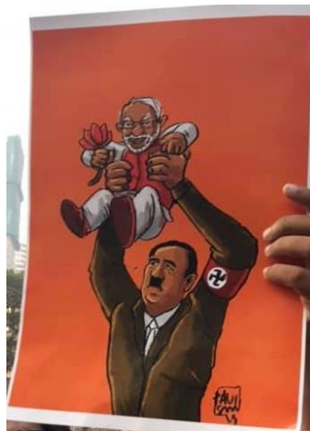
Figure4. (Hitler holding baby Narendra Modi – a Lion King reference)

opposition, to intertwining of religion and governance. While all of this speaks of the ‘Fascists’, the very emotion of the meme can be recorded in the Furious, which may refer to the fury on behalf of the government itself, levying out their atrocities and brutality by the hands of the police force on the people or it can also refer to the very sentiment of the protesters who stand against the fascist regime. This meme calls out against the very power structure of the government expressing their dissent, using the vehicle of humor and agency of memes.