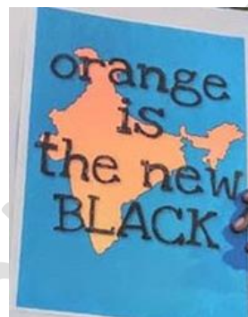
Figure2. Orange is the New Black

The emotions that can be noted in the proverb is that of challenge and questioning – 'Toh Kya Karega' thereby daringly expressing the essence of harmony and brotherhood, against the dividing forces.