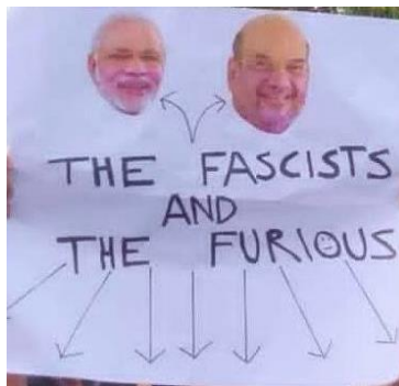
Figure3. The Fascists and The Furious

the political context where orange is predominantly the color of the extreme right wing – The BJP, the RSS and the very color the entire Hindutva ideology is painted in. The significance of the color orange to these parties also lies in Hindu mythologies referring to ‘vermilion’(sindhur), and to the many mythologies associated with the same. Having said this, the political meme yet stands as a political critique of the ruling government by reinstating that all the other colors fade out and what stands as the prime colour is Orange the colour of the Hindutva Propogandist movement.